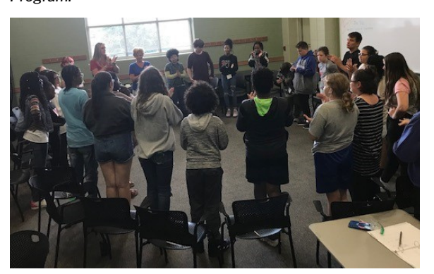
School Care Team partnered with the library to present a session mental well-being for today's youth. This was held afterschool for all the attendees of the library's afterschool program.