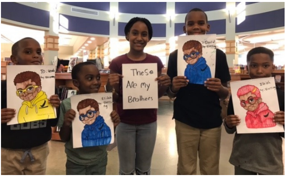
Youth work together and collaborate with younger siblings on projects in the children's department