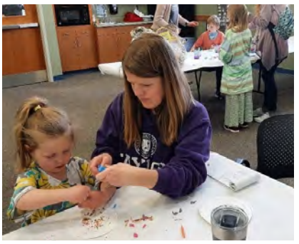
Mom and daughter do some crafting during Family Fun Night at GEO.