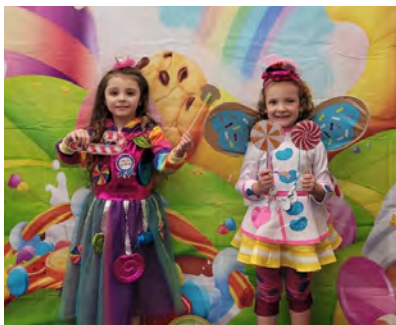
Giant Candyland went up at GEO as part of National Library week.