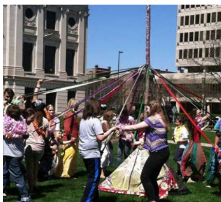
Maypole on the courthouse lawn

The Allen County Public Library received the community's help to document specific days in Allen County, Indiana. Here are some highlights from a decade ago!