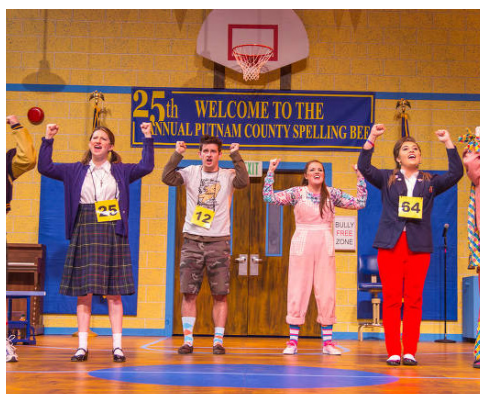
25th Annual Putnam Co. Spelling Bee at Arts United Center